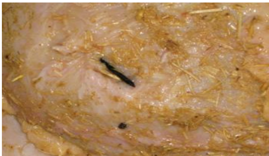
Figure 2. Outward appearance of a nail that perforated to the reticulum wall.