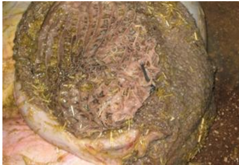
Figure 1. Appearance of a nail that stung at the reticulum.